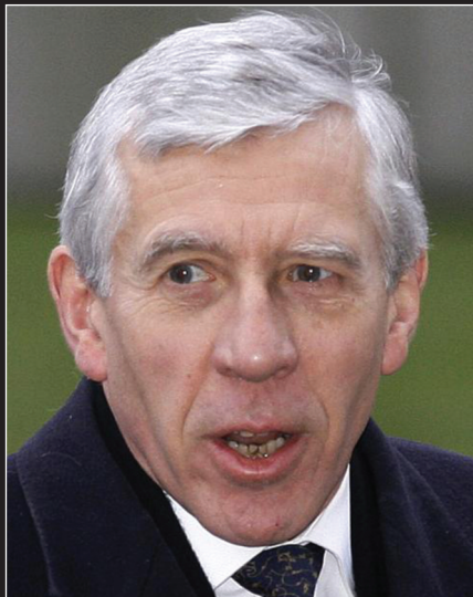
JACK STRAW £5,000/day