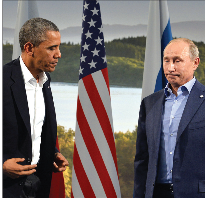
AUTOCRAT: Putin is seen as undermining strategic western interests

Much has been made of Russian intervention in Ukraine; in the mostly Russian east of the country. Yet look at the facts. It is estimated that more than 6000 people have been killed. Almost all are ethnic Russians killed by Ukrainian forces. A third of a million people have fled to refugee camps along the Russian border. Almost