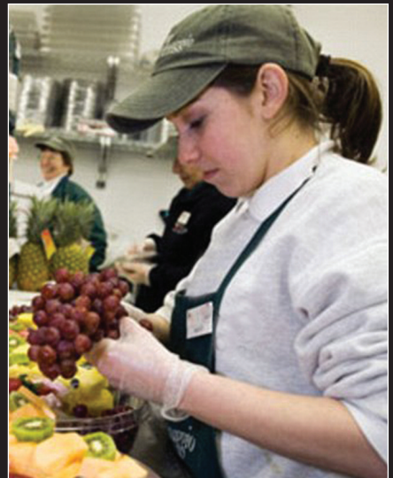
LOW PAID WORKER £6.50/hour