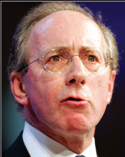
SIR MALCOLM RIFKIND £1,619/hour