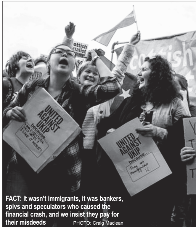
FACT: it wasn't immigrants, it was bankers, spivs and speculators who caused the financial crash, and we insist they pay for their misdeeds

If it is ever to be run in the interests of the peoples of Europe, all 500million of us, then a democratic, socially just pan-European plan needs to be set out and implemented. The SSP is committed to working in a pan-European alliance to achieve a