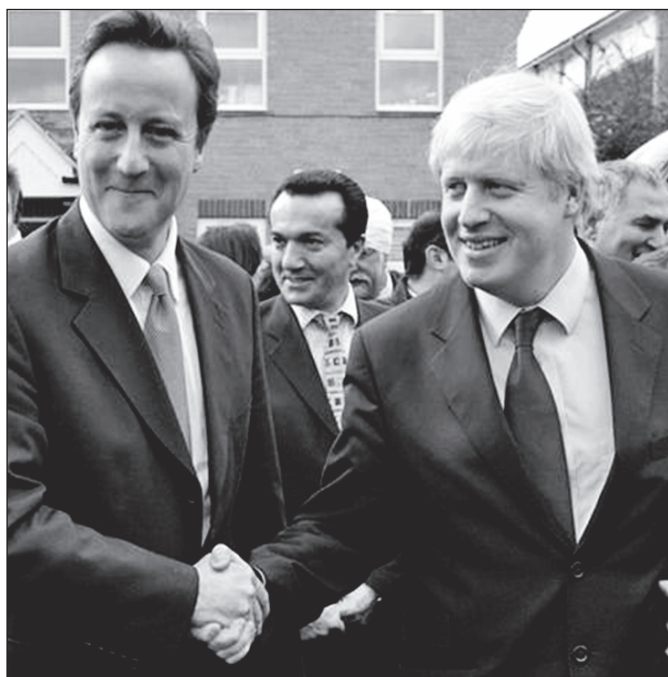
VENDETTA TOGETHER: Tories fear a revolt growing against poverty pay

of an £8 minimum wage, ignoring the stark reality they are only promising this figure five years from now, 2020, with inflation meantime wiping out any meaningful increase this figure would mean.